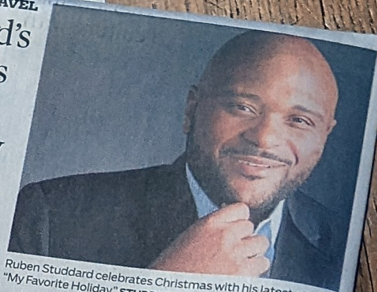
Ruben Studdard celebrates Christmas with his latest album, "My Favorite Holiday."

A: Being able to travel and see how different cultures react to my music is awesome. There's nothing like being in a room with people (who) don't speak English, but they can sing